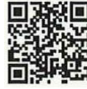
For Feature phone (Garakei)