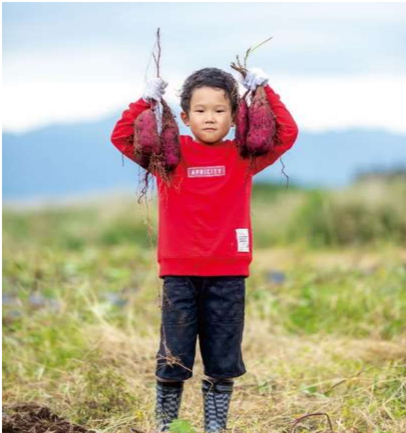
Kanko Imohori-en (Sweet potato digging at Inno)