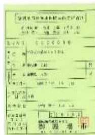
National health insurance card